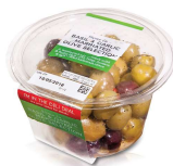
SNACK FOOD | A-PET