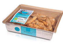
FISH | BOARD