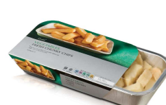
READY MEAL | SMOOTH WALL FOIL

for more information UK +44 (0) 1625 856 600 America +1 804 447 9038 Australia +61 (0) 3 9397 0955