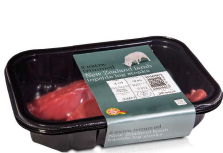
RED MEAT | C-PET