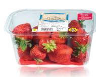
PRODUCE | A-PET