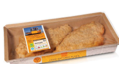
FISH | BOARD