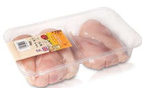
POULTRY | POLYPROP