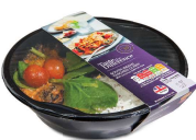
READY MEAL | C-PET