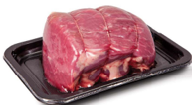
RED MEAT | POLYPROP