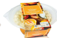
PUDDINGS | A-PET

for more information UK +44 (0) 1625 856 600 America +1 804 447 9038 Australia +61 (0) 3 9397 0955